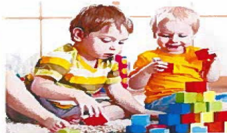
Language & Communication