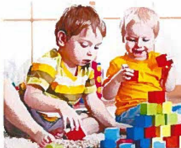
Language & Communication