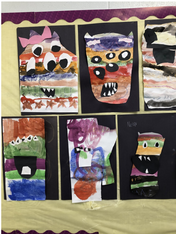
Grade K/1/2 Art Work "Monsters"