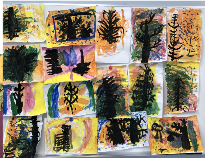
Grade K/1/2 Art Work "Trees"