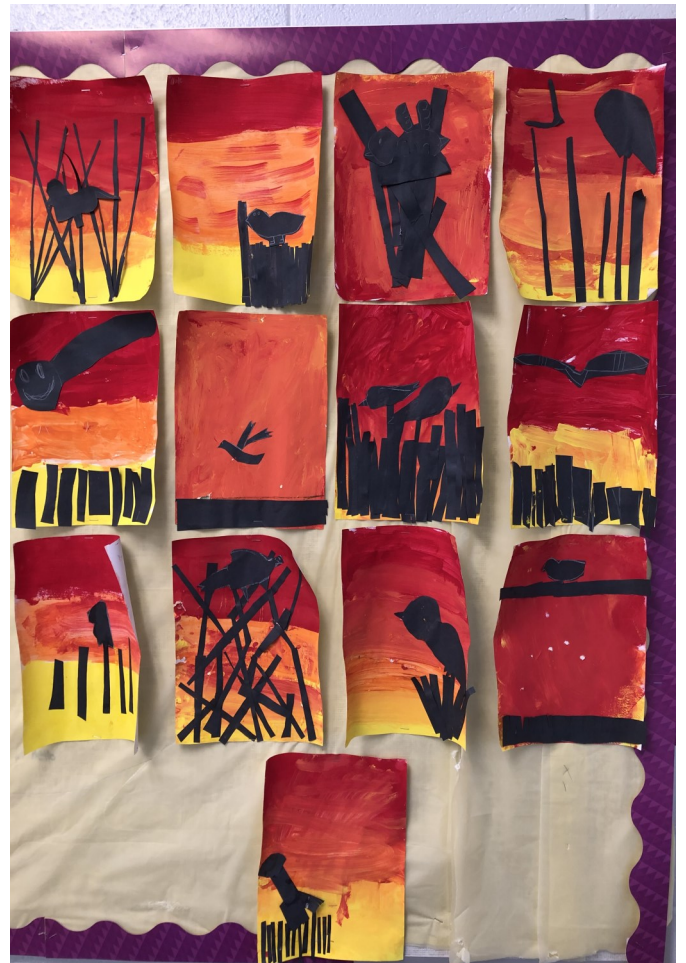
Grade 2/3 Art Work "Birds"