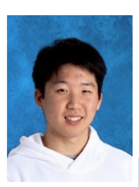
Warner School Graduating Class Of 2021