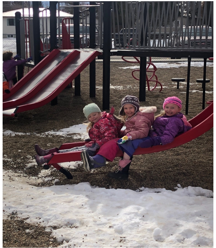
Fun times on the playground!