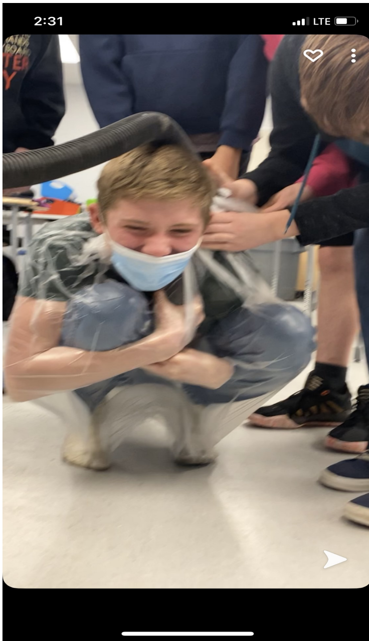
Grade 8/9 Class learned that the pressure of the atmosphere is very large