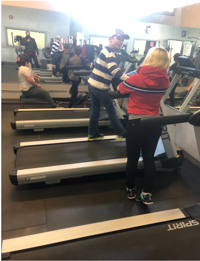
Phys Ed class at the workout gym.