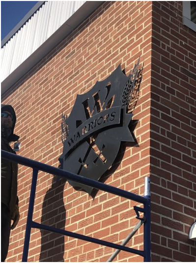
Warner School has a new sign! Next time you are at the school check it out! It is down by the playground. Thanks to Prairie Medal Craft!